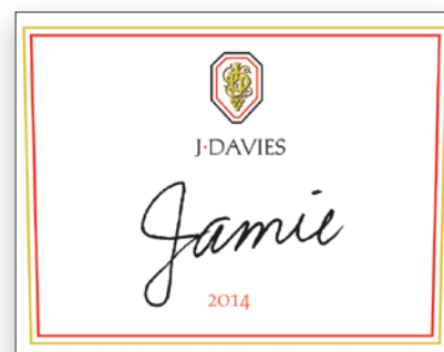
2014 J. DAVIES "JAMIE" CABERNET SAUVIGNON DIAMOND MOUNTAIN DISTRICT

TASTING NOTES - "This wine holds perfumed aromas of dark red cherry, dried strawberry, raspberry and rose petal combined with violet, black tea and coffee. Dense concentrated fruit flavors of black currant, black cherry and mint mingle effortlessly with dark chocolate and are seamlessly brought together with a well-structured, rich mid-palate."