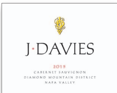
2015 J. DAVIES CABERNET SAUVIGNON DIAMOND MOUNTAIN DISTRICT